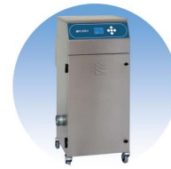
Fume Extraction System