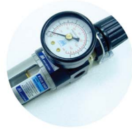
Air Compressor Filter