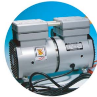
Air Compressor Unit